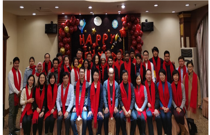
APFNet Scholarship Students of Nanjing Forestry University together with the APFNet Executive Director and NFU Professors and staff posed for a photo during the New Year Gala.