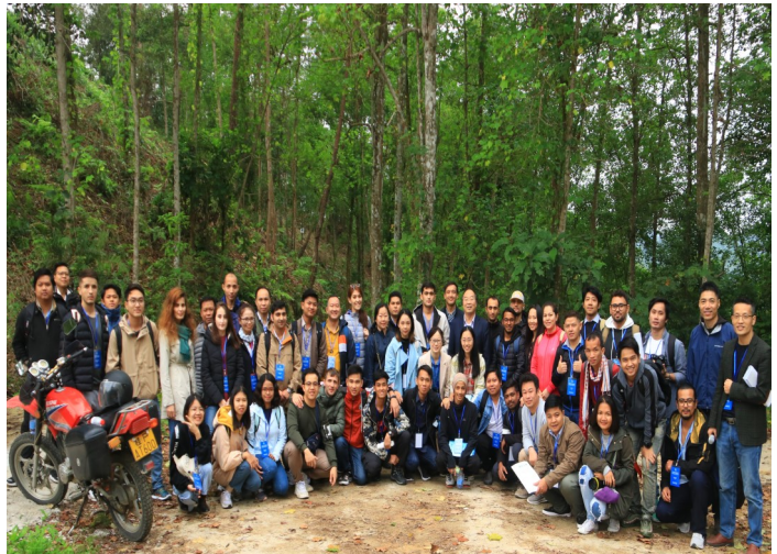
APFNet scholarship students from BFU, NFU, & NWFU visited a demonstration project during the internship

Another important highlight of the internship was the workshop which gave room for students to discuss on their learning and shed light on the forest management issues