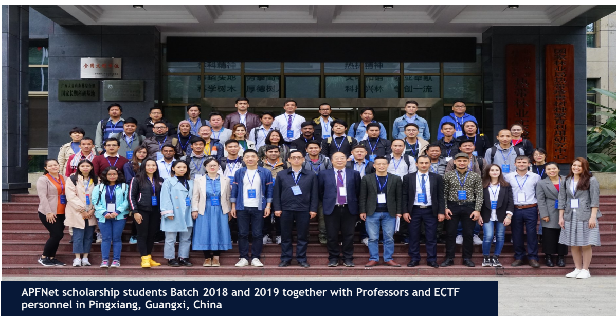
APFNet scholarship students Batch 2018 and 2019 together with Professors and ECTF personnel in Pingxiang, Guangxi, China

APFNet just recently inked a cooperation with Chulalongkorn University in Thailand for its scholarship program that will support two students annually. This milestone is a good start to expand the coverage of the scholarship program. Currently, there are two students studying in Chulalongkorn University taking their Master's Degrees under Environment, Development and Sustainability program.