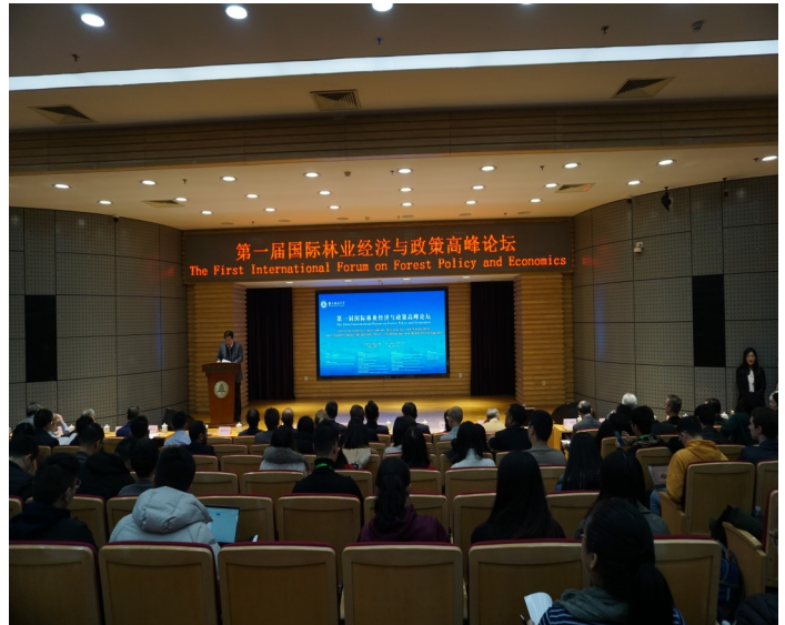
Participants during the opening ceremony of the 1st Asia-Pacific Forestry Forum

Participants of the forum also took part in panel discussion on the key issues of forest restoration and sustainable management in Asia-Pacific, and how to achieve effective conservation and sustainable development on a global scale. The forum was concluded with participants signifying their intentions to take active participation for the attainment of sustainable development in the region with high hopes that it will be achieved in the future.